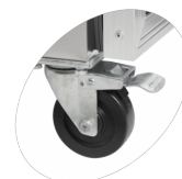
Strong wheels as option